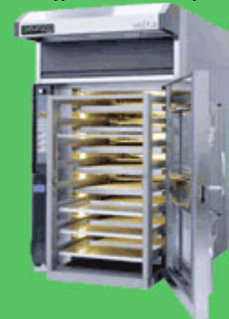
Multiple loading system for TRAYS (baking on trays)