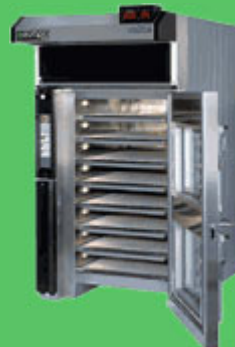
Volta with full door open