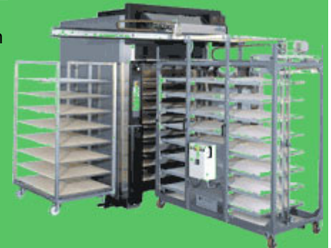
Multiple loading system for SETTERS (direct baking on the sole)